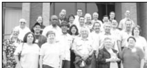
Neighborhood leaders from Districts 1-5 get ready to head out on the SAWS tour.

Leaders of neighborhood groups toured sites across the city to gain a better understanding of the range of work and challenges that SAWS manages each day. It was a great opportunity for citizens to get a first-hand experience of the size and complexity of the system that includes over 9,000 miles of pipe.