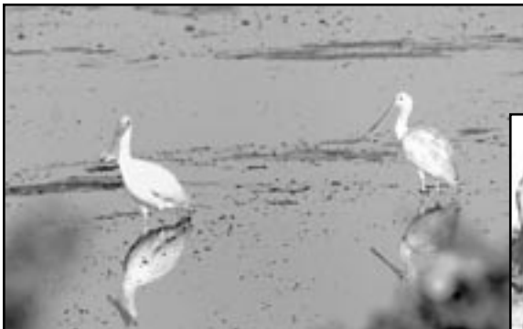
Migrating birds like these Roseate Spoonbills are spectacular visitors in the fall and spring.

Mitchell Lake Audubon Center is located at 10750 Pleasanton Road. Hours for the center are Saturday, 8am – 4pm and weekdays by appointment. For more information on hours call the center at 210-628-1639.