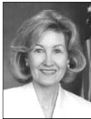
U.S. Senator Kay Bailey Hutchison