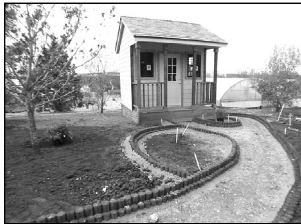
This Texas setting is just about to get the final landscaping.

GardenVille, Garden Volunteers of South Texas and several area nurseries are constructing the Lawns and Environment display. In addition to our external partners, several SAWS employees were of huge assistance.