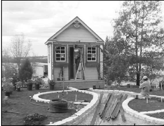
SAWS employees are working hard putting the finishing touches on the displays.

Thanks to SAWS partners on the project including: San Antonio Parks and Recreation, the San Antonio Botanical Society, Texas Turfgrowers Producers,