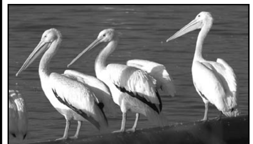
Migrating pelicans sunning at Mitchell Lake.

Mitchell Lake is located on a migratory route, and serves as a natural resting place for tens of thousands of birds each year. Mitchell Lake already draws birders from around the world but – until now – has been open on a limited basis, and without bathroom or office facilities.