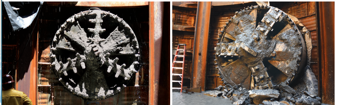
Twice as "boring," but twice the power. Two tunnel boring machines completed their months-long underground journeys just hours and a few feet apart in May for SAWS' massive W-6 sewer replacement project along U.S. Highway 90 and SW Military Drive. The project to replace and upsize a giant sewer main near Joint Base San Antonio-Lackland involves five miles of tunnels, to avoid disrupting traffic and military activity on the surface. Construction is expected to be completed in 2023.