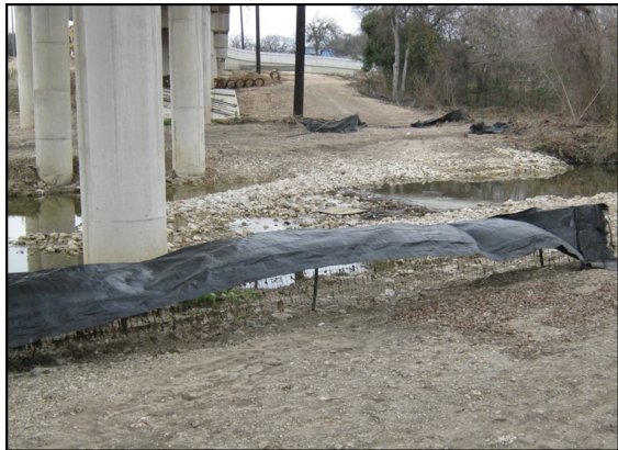
Silt fence in good condition?