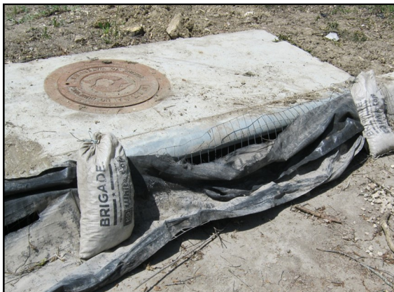
Curb inlet protection?

all registration Form to: stormwaterconstruction@saws.org Or Matthew.Apaez@saws.org