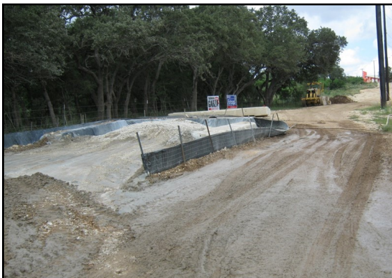
Effective Concrete Wash Out?